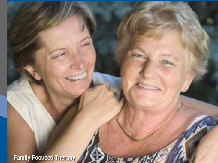
Family Focused Therapy

Family Behavioral Resources is an approved provider for the PA Adult Autism Waiver.