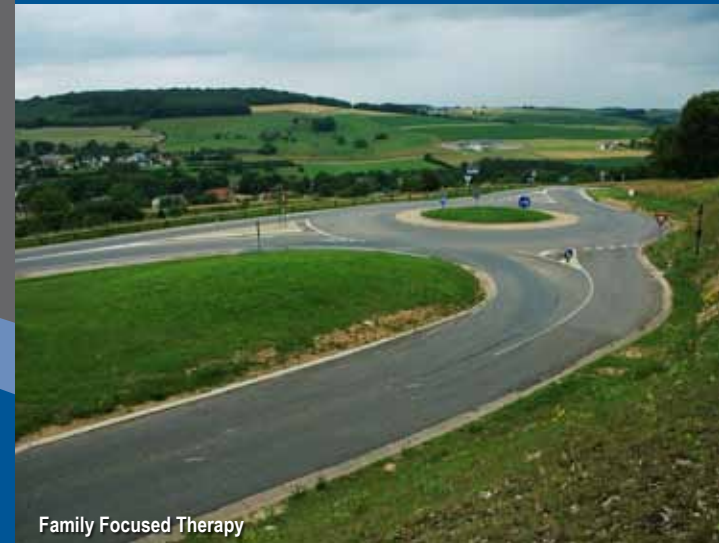
Family Focused Therapy