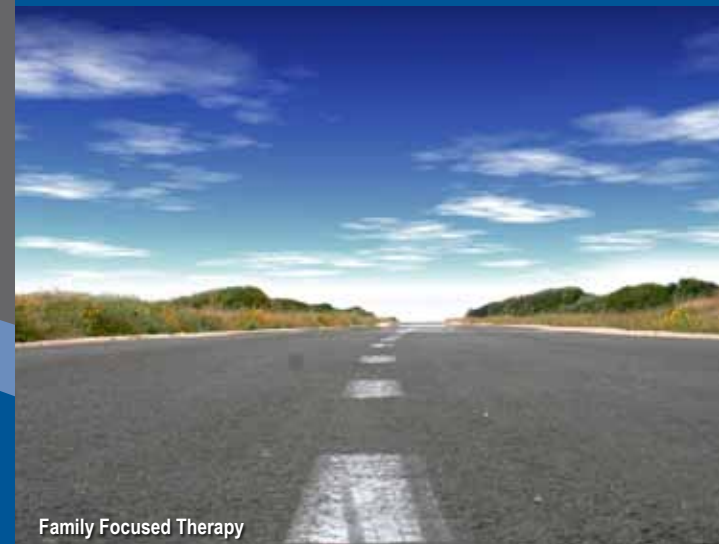
Family Focused Therapy