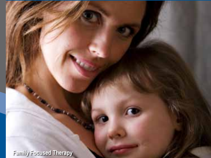
Family Focused Therapy

Current studies have shown that Autism affects 1 in 110 children, 1 in 70 boys (Center for Disease Control, American Academy of Pediatrics). If your loved one is affected, our Specialized Autism Services can make a difference.